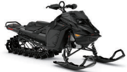
SUMMIT X WITH EXPERT PACKAGE 154 850 E-TEC TURBO R SHOWN

The ultimate deep-snow sled with features sharpened for technical terrain riding.