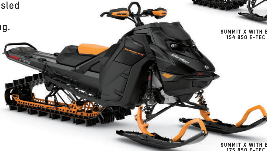
SUMMIT X WITH EXPERT PACKAGE 175 850 E-TEC TURBO R SHOWN