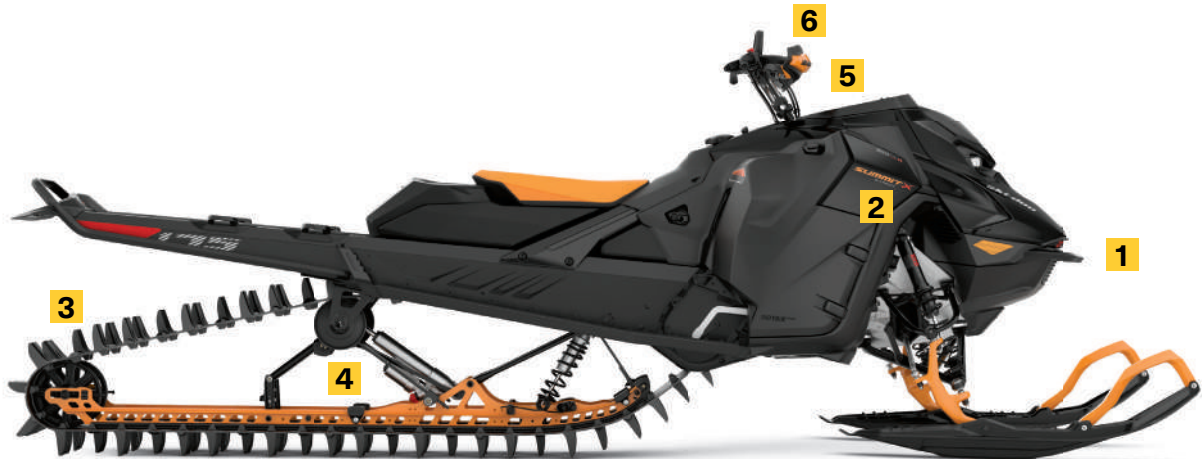
SUMMIT X WITH EXPERT PACKAGE 175 850 E-TEC TURBO R SHOWN

This lighter, redesigned track unique to the Expert package has a stiffer edge that complements the tMotion XT for more rigidity in the rear skid.