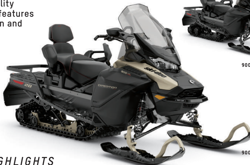
EXPEDITION LE 900 ACE TURBO SHOWN

A hybrid crossover-utility vehicle with premium features for off-trail exploration and on-trail cruises.