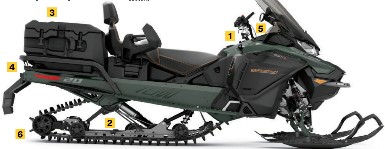
EXPEDITION SE 900 ACE TURBO SHOWN

135 L/35.7 US gal of lockable, weather-resistant storage capacity. Incorporated hatchet and saw holder, plus attachment points for bungees and two 16 in. LinQ positions on top for expandable accessory use.