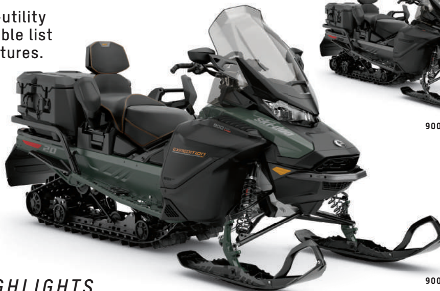
EXPEDITION SE 900 ACE TURBO SHOWN

The utmost crossover-utility vehicle with an incredible list of work and luxury features.